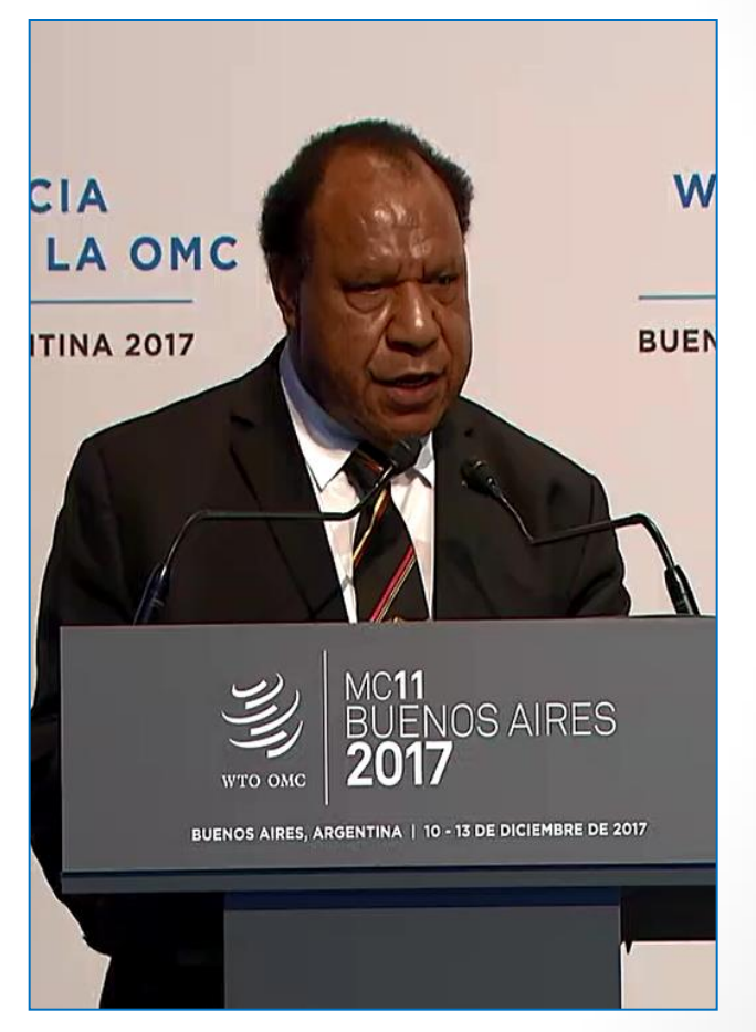
Wera MORI, Minister, Papua New Guinea

Papua New Guinea has one third of the world's tuna; the fish that feeds the world.